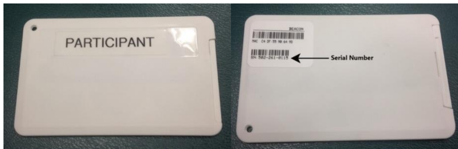
Figure 2. The BLE tag.

To identify when the participant was driving and when someone else was driving, the participant and all individuals who regularly drove the participant in the participant's primary vehicle were asked to carry a credit-card size Bluetooth low energy (BLE) tag (see Figure 2) that broadcasted a unique ID. All IDs in the vehicle, and their signal strengths, could be picked up by the datalogger and saved with the trip data. These IDs and signal strengths were analyzed to determine who was driving the vehicle on each trip (with the tag closest to the datalogger determined to be that of the driver). Data for trips made by drivers other than the study participants were not retained in the database.