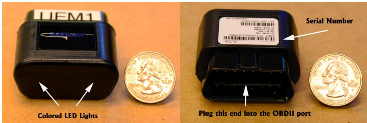
Figure 1. The Danlaw DataLogger.

To identify when the participant was driving and when someone else was driving, the participant and all individuals who regularly drove the participant in the participant's primary vehicle were asked to carry a credit-card size Bluetooth low energy (BLE) tag (see Figure 2) that broadcasted a unique ID. All IDs in the vehicle, and their signal strengths, could be picked up by the datalogger and saved with the trip data. These IDs and signal strengths were analyzed to determine who was driving the vehicle on each trip (with the tag closest to the datalogger determined to be that of the driver). Data for trips made by drivers other than the study participants were not retained in the database.